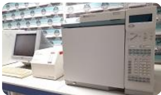
Gas Chromatograph (HP 6890)