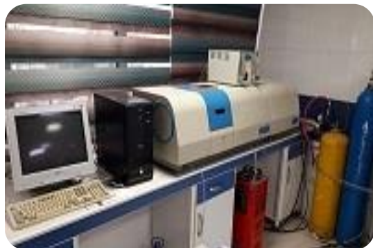
Atomic Absorption Spectrophotometer (PG990)