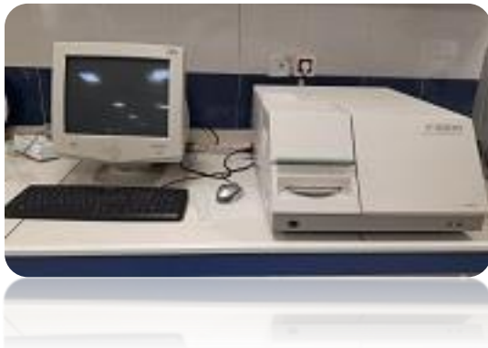
Spectrofluorometer (Hitachi F-2500)