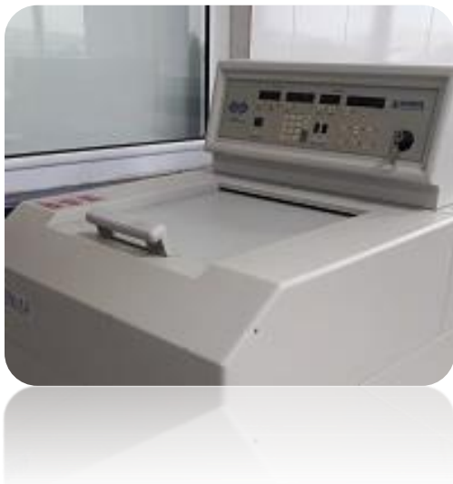
Ultra Centrifuge (Hanil Scientific)