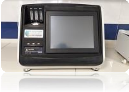
Ion Mobility Spectrometer (CD-1500)