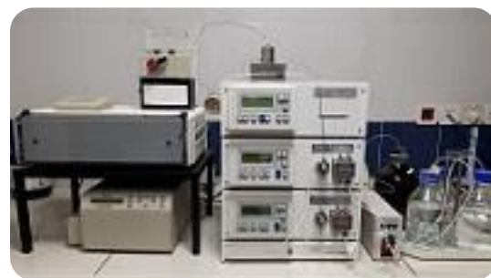
HPLC System (CECIL Instruments)