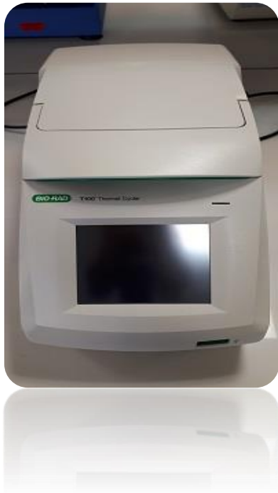
BMS- MIC qPCR