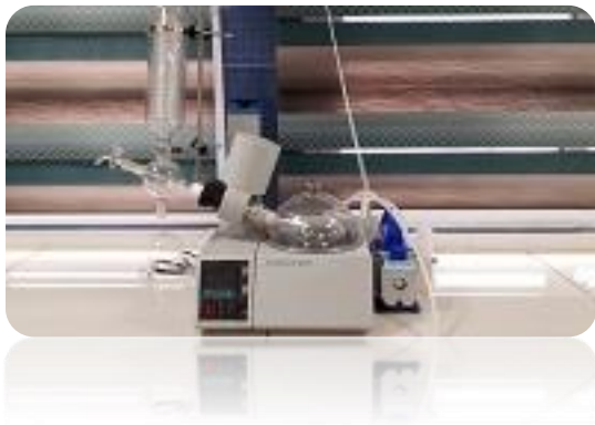
Rotary evaporator (Lanphan RE-52AA)