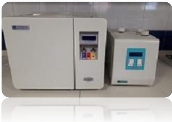
Gas Chromatograph (GC: FID, TCD and HID)