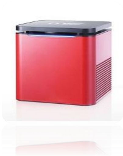
Thermal Cycler TM100